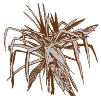
Ke Kula 'O Nāwahiokalani'ōpu'u